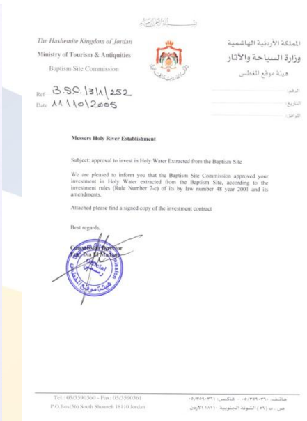
Baptism Site Commission